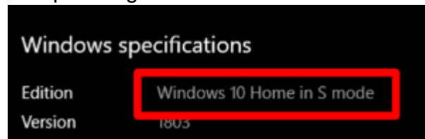
Sample image of Windows 10 Home in S mode