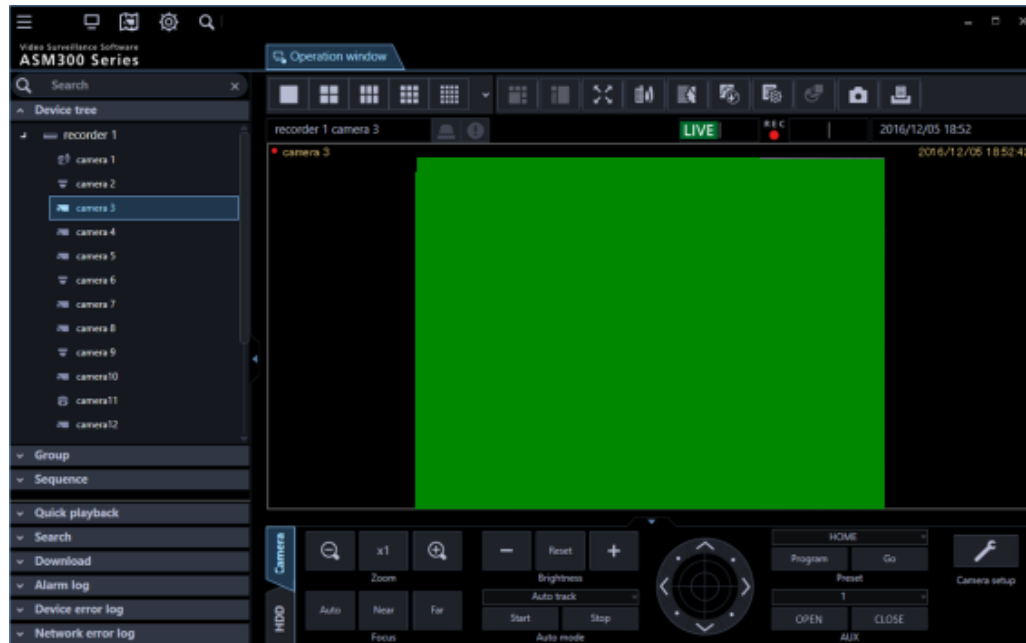
[Example of the issue]

When “4K” is selected for the “PC diagnosis (4K camera)” function of WV-ASM300 an issue may occur in which the camera image display becomes full screen green . If the issue occurs, please switch to the “Normal” setting.